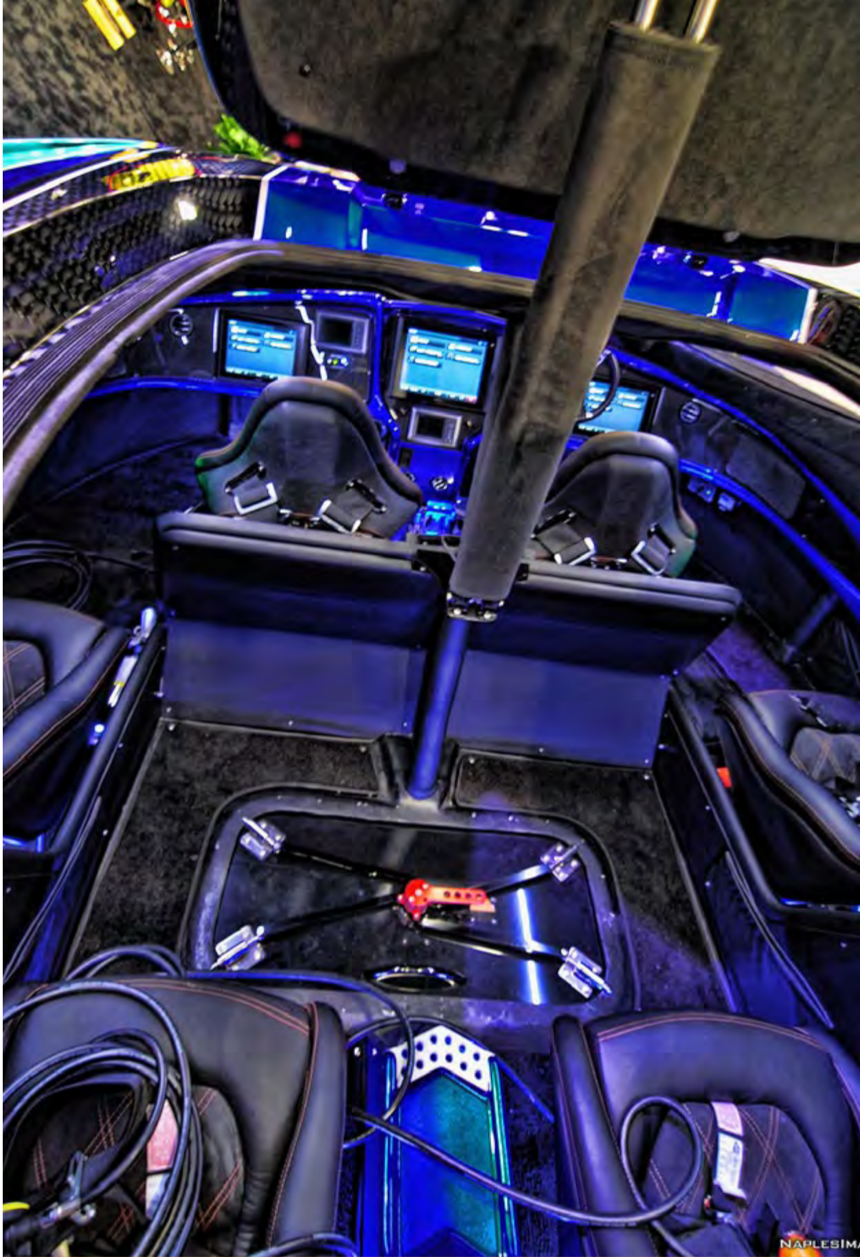
Each of the cat's six bucket seats in the uniquely configured cockpit has a five-point restraint harness as well as its own emergency oxygen system.

Scism and Benson struck a deal on the new 52-footer, which Benson wanted “to be like a raceboat with a slightly nicer cockpit and no numbers on the side.” Benson originally ordered the cat with Mercury Racing 1350