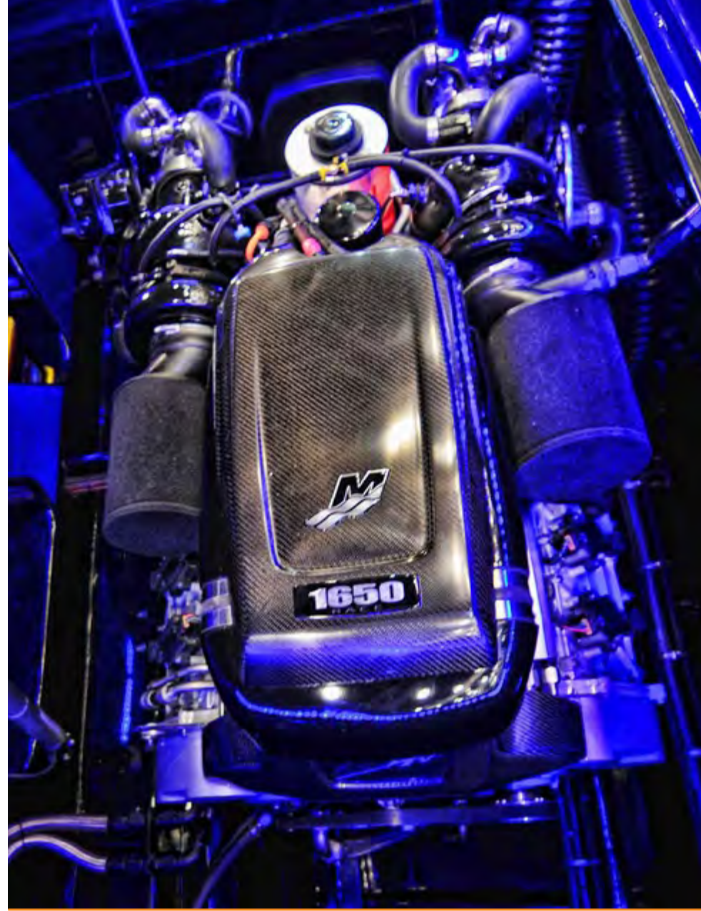
A pair of 1,650-horsepower turbocharged beauties from Mercury Racing powers the show-stopping 52-foot cat.

however, has more than a few features you'd typically find in a raceboat in addition to its roll cage and extra stout canopy. Each of the cat's six forward-facing bucket seats—the front four being of the suspension variety—has a five-point restraint harness. Each also has its own emergency oxygen system. The hull is equipped with two escape hatches, one forward and one aft, in the event it overturns.